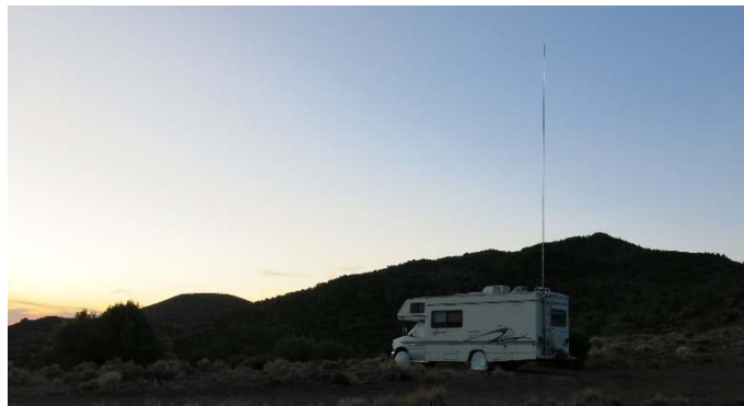
The sun sets on the N4XD mobile station near Bryce Canyon National Park.

While the “Zone 6 Big Guns” were preparing to fight for West Coast supremacy, Ron, N4XD, was in Utah, in the midst of a cross-country trip from Washington State back to his home in North Carolina.